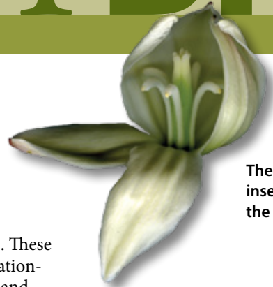
The yucca flower is insect pollinated by the yucca moth.

Systematists have tried to understand how species are related to each other since Theophrastus, the father of botany, lived between the third and second century BC. Down through the ages, they have depended on comparing flower structure, stems and leaves to sort out relationships.